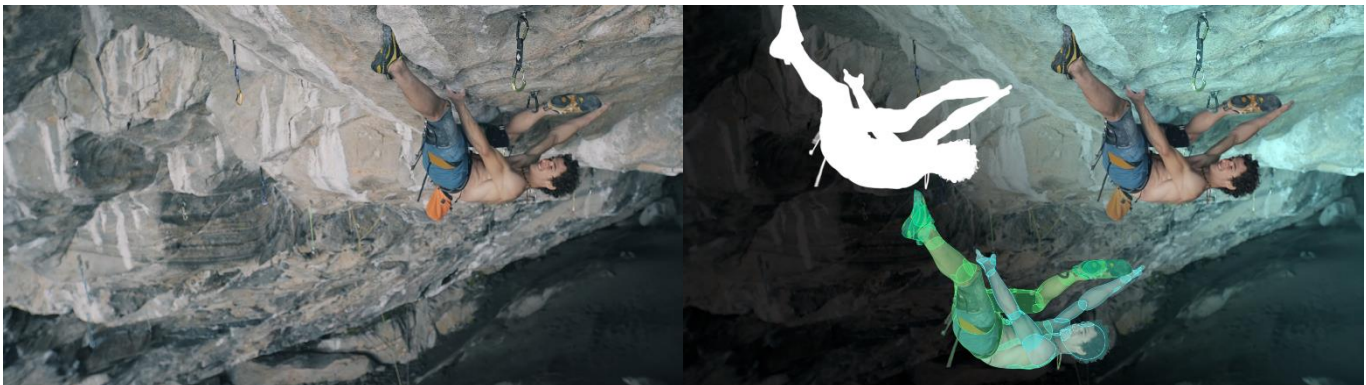
PLATE / SPLINES / ALPHA (SILHOUETTE FX)